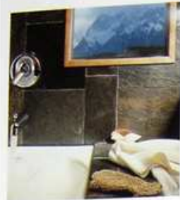
Explora's dramatic setting, as viewed through a bathroom window