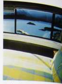
Explora is perched beside the Rio Paine in the middle of six hundred square miles of national park