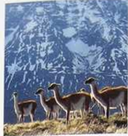
Only llamas are equipped to deal with Patagonia's soaring, bleak, isolated peaks