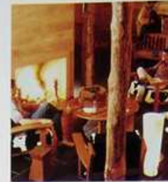
The warmth and intimacy of the interior compensates for the 'outdoors in all weather' policy during the day