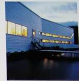
The architecture of Patagonia's Explora is one of extreme contrast - of pristine modernity versus untamed nature