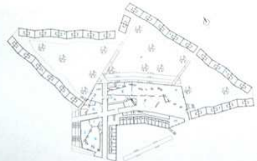
ground floor plan (scale approx. 1:1500)